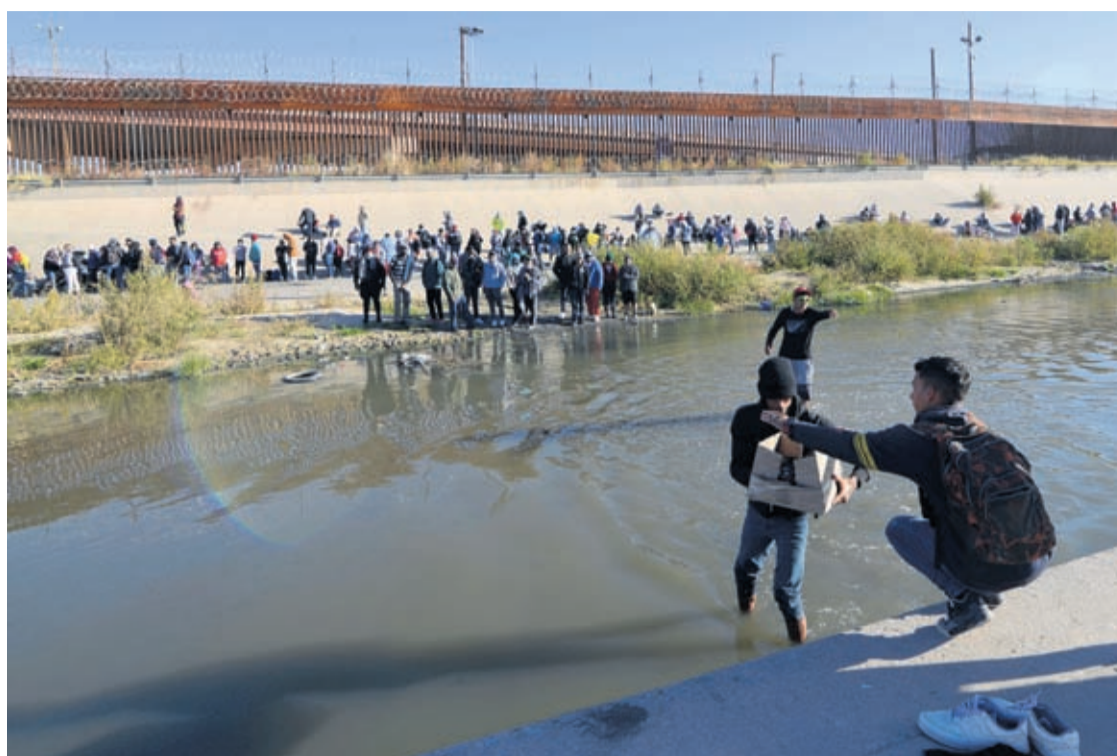
Migrants cross the Mexico-U.S. border to surrender to U.S. Border Patrol agents, in Ciudad Juarez, Mexico, Monday, Dec. 12, 2022.

The National Immigration Institute announced the closure of the camp in the remote town of San Pedro Tapanatepec in a statement Monday night without explaining its reasons. The agency said it would continue supporting migrants in other installations, without specifying where. Town officials in San Pedro Tapanatepec had requested the closure, which had been rumored for weeks. The camp originally opened in late July as a way to relieve pressure on the southern city of Tapachula at the border